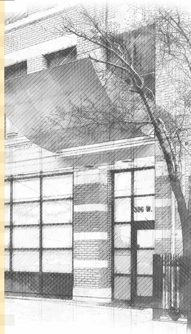
Callen-Lorde Community Health Center 6 Year HEI Participant