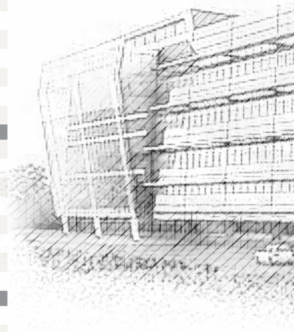
Einstein Medical Center Elkins Park 3 Year HEI Participant