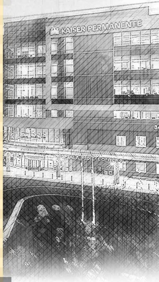
Kaiser Permanente, Orange County Anaheim Medical Center 10 Year HEI Participant