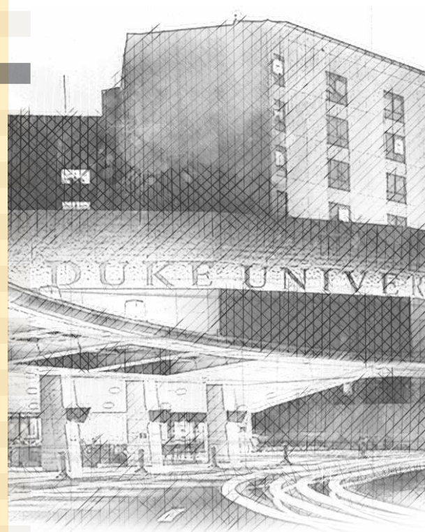
Duke University Hospital 8 Year HEI Participant