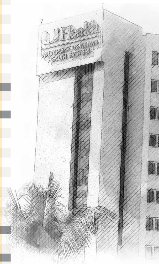
University of Miami Hospital 2 Year HEI Participant